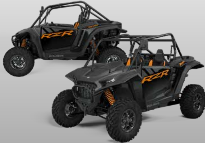
RZR XP 1000 SPORT